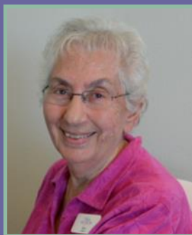
Grande Dame of the VMA