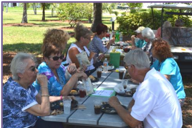
A beautiful day for a picnic in Blalock Park