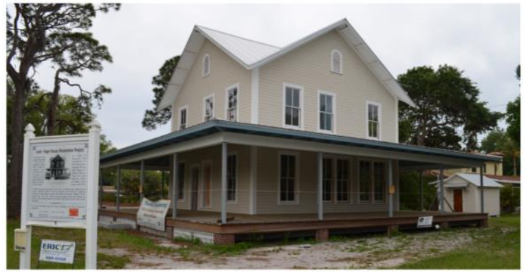
Lord-Higel House, April 15, 2016

To contribute, please visit the fund's link at Gulf Coast Community Foundation http://www.gulfcoastcf.org/lhh.php