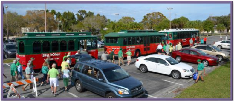
The VMA was the first stop for the annual Newcomers of Venice Alumni tour. They were a festive sea of green on St. Patrick's Day.