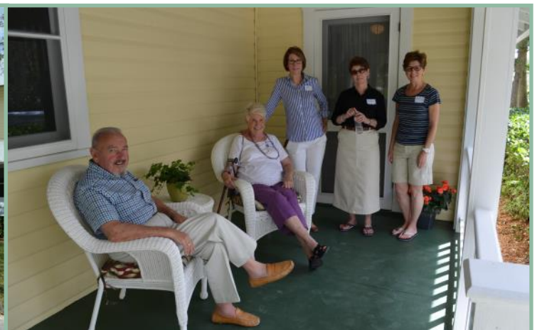
Members of the EPC Centennial Committee on the front porch of the Eagle Point Clubhouse.