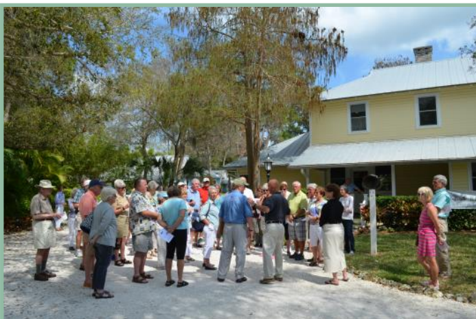
Tours at Eagle Point Club were a smashing success thanks to the EPC residents, who led the tours.