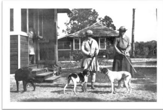
Eagle Point guests and cottages, circa 1917