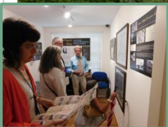
Above and at left: On May 4th the Florida Association of Public Art Professionals held its annual conference this year in Venice. Participants were given a tour of the VMA before heading across the street to Blalock Park to view the public art sculptures.