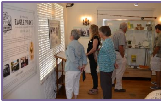
Visitors enjoying the Eagle Point exhibit at VMA