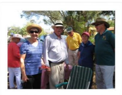
2016 VHI annual meeting